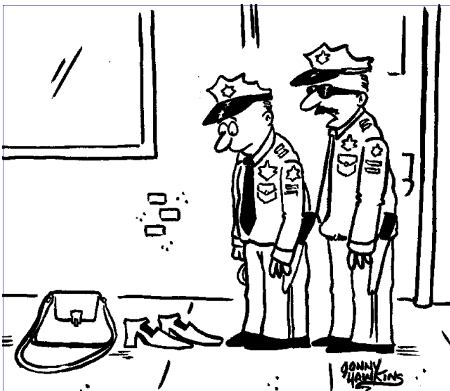
"Book 'em, Pete, they're being charged as accessories."

So bottom line, leave your computer on all night and restart it two or three times a week to clear the memory.